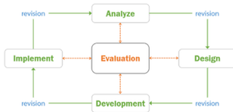
Figure 2. ADDIE Model

This research will implement ADDIE model (Branch, 2009) which stand for Analyze, Design, Development, Implement and Evaluation. Since this model is more practical and easier to be carried out, yet it fulfills the important element in R&D. The procedures of the ADDIE model will be explained as follows: